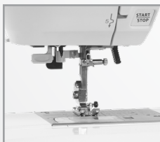
BUILT-IN NEEDLE THREADER

The eXperience 560 features cutting-edge technology to make your sewing much easier. Utilize the machine's built-in needle threader, presser foot lift, auto-declutch bobbin winder and 7mm stitch width. The backlit LCD screen with easy navigation buttons makes choosing stitches a breeze. The eXperience 560 is the perfect tool for creative enthusiasts who want to get a fresh start on sewing garments, home decor and quilting. This 100 stitch sewing machine ensure that projects are conquered with power, precision and confidence.