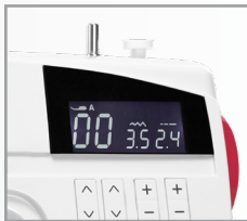
BACKLIT LCD SCREEN WITH EASY NAVIGATION KEYS