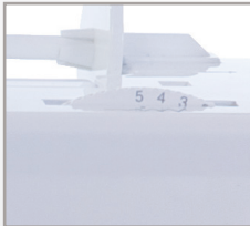
ADJUSTABLE STITCH WIDTH

Sail through the most complex sewing challenges! With the eXplore 320, you'll navigate effortlessly through any project, from minor alterations to major new creations. Feel the bracing thrill of new possibilities, ride the wave of your imagination and above all... enjoy yourself! Thanks to Elna's easy-change spool system and automatic needle threader, every move is a winner. And you'll go overboard using the huge range of practical and decorative stitches as you chart a new course in creativity.