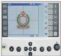
RCS (REMOTE COMPUTER SCREEN)

Precision Performance. Create your own style ! Whatever your fancy, the eXpressive 940 takes any motif and fabric in its stride. Perfectionist? A large, colour touch screen helps you quickly visualize, modify and finalize your desired result. Totally autonomous operation ! Automatic colour change, thanks to four separate needles.